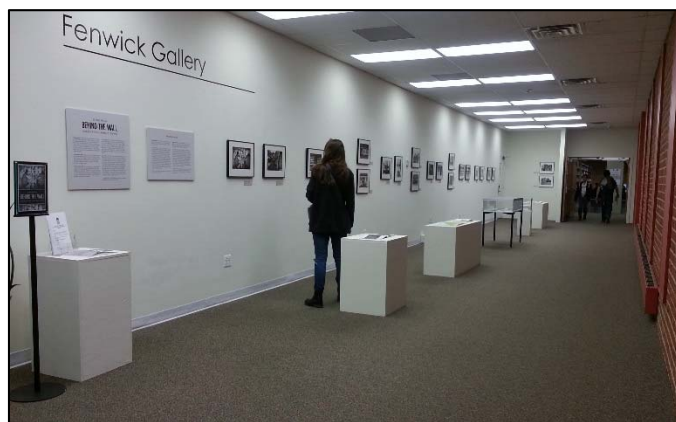
Student visitor to exhibit Scenes from Behind the Wall: Images of East Germany, 1989/90

This one-month exhibit was followed by Scenes from Behind the Wall which featured photographs of East Berlin and the Berlin Wall from Special Collections and Archives. Under the supervision of the Art and Art History Librarian, Smith selected and installed photographs from this collection. This exhibit was important because it facilitated inter-departmental collaboration, and it had resulted from faculty input from the History Department. At the same time, Special Collection hosted an exhibit featuring East German posters. The library hosted an exhibit reception that was attended by History faculty and students, as well as library staff.