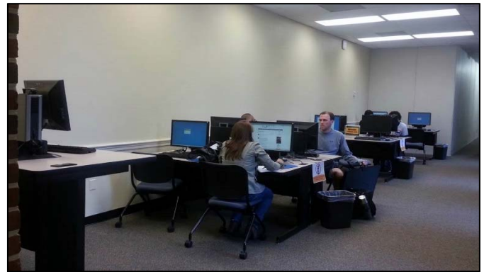
Computer Hallway before the gallery conversion

With advances in library automation, the card catalog was retired and the hallway space morphed into rows of OPACs. These were eventually replaced by public PC workstations. In 2013, the PCs were moved due to the most recent Fenwick Library Addition mentioned earlier (scheduled to be completed in 2016). Once cleared, the open hallway space prompted the idea to create an interactive public gallery.