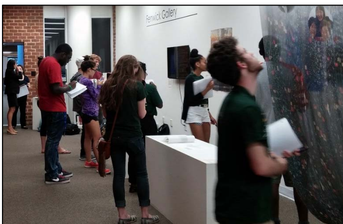
Class visit to the faculty-curated Call and Response exhibit