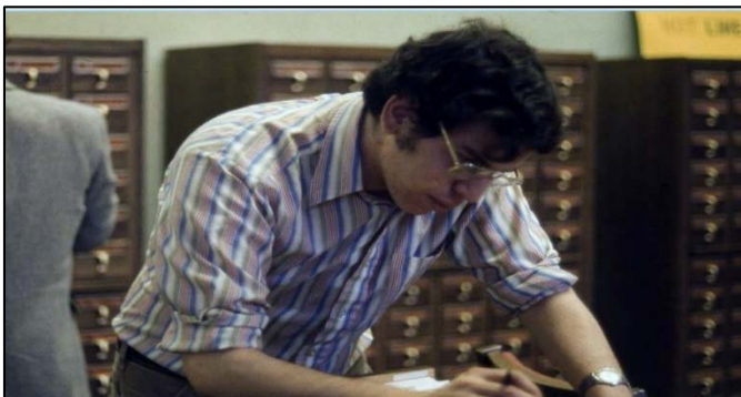
Hallway when it was used to house the card catalog

Initially connecting the original library building (Wing A) with the tower extension (Wing B) in 1980, the first floor passageway in Fenwick Library has always been a primary user space. This area was not only the hallway leading to the library's elevators, stacks and study spaces; the card catalog was located in this space as well. Even with the addition of a new tower (Wing C) in 1984, the hallway remained the only connecting corridor to both Fenwick towers.