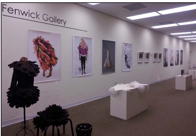
Inaugural exhibit Women's Voices/Women's Visions

In conjunction with the exhibits, books and occasionally journals and maps are selected from the library collection to support the exhibit themes. Books are selected from both the circulating and references collections, and those with borrowing privileges are allowed to check them out. These resources support the scholarly focus of the exhibits. For example, during the Women's Voices/Women's Visions exhibit books on women's issues in the humanities and social sciences were chosen and placed on the bookcase in the gallery. In addition, several copies of the student journal So to Speak were included in the display since several pieces in the exhibit were featured in the journal. Rinalducci worked with the Head of Technical