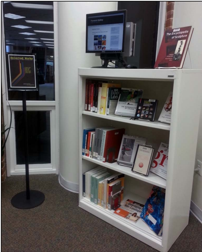
Bookcase in the gallery to display print resources that complement the exhibit

Services, Tricia Mackenzie, to establish a system that marks the selected items as temporally located in Fenwick Gallery.