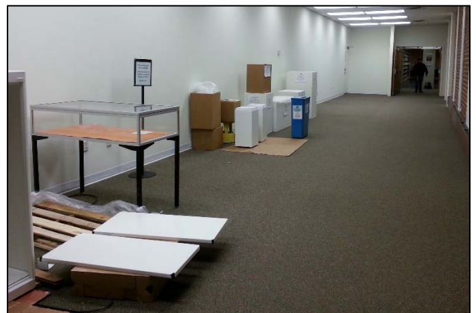
Preparing the passageway

Signage for the new gallery was another important consideration. After creating mock-ups in a variety of fonts and sizes Century Gothic was chosen for a simple sign marking the area as Fenwick Gallery. A local company in the Virginia purchasing system was hired to create and install the sign.