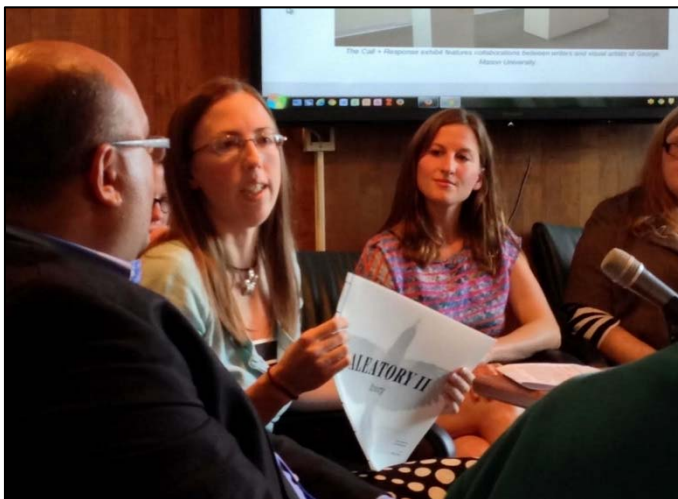
Gallery talk with artist/writer pairs from Call and Response exhibit during Fall for the Book Festival