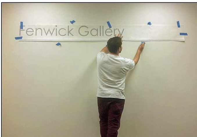
Installing the gallery sign

Lighting and potential damage from light was another central concern, and an examination of the literature was required. 3 It was discovered that the overhead light bulbs were not a standardized size, and therefore UV filters could not be attached to them. To help minimize some of the potential damage, it was agreed that a selection of light bulbs could be removed. As it happened two of the windows needed to be covered during construction so the remaining five windows were covered with attractive wood panels to maintain the aesthetic and to minimize UV damage. Eventually, the panels were painted to match the red-brown color of the brick wall. The intention for the new paint color was to minimize distractions that could potentially draw visitors away from the artwork. These lighting issues should be more fully resolved in the new library addition.