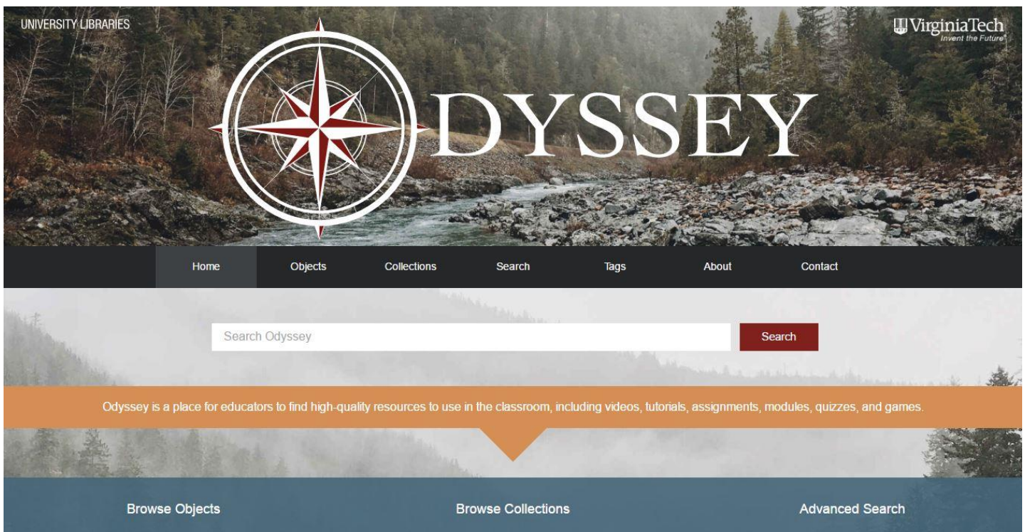
Figure 3: Odyssey The homepage of the Odyssey Learning Objects Repository, available at https://odyssey.lib.vt.edu/

While the Learning Design Studio was being developed, we began the process of creating learning objects, building on existing partnerships with faculty