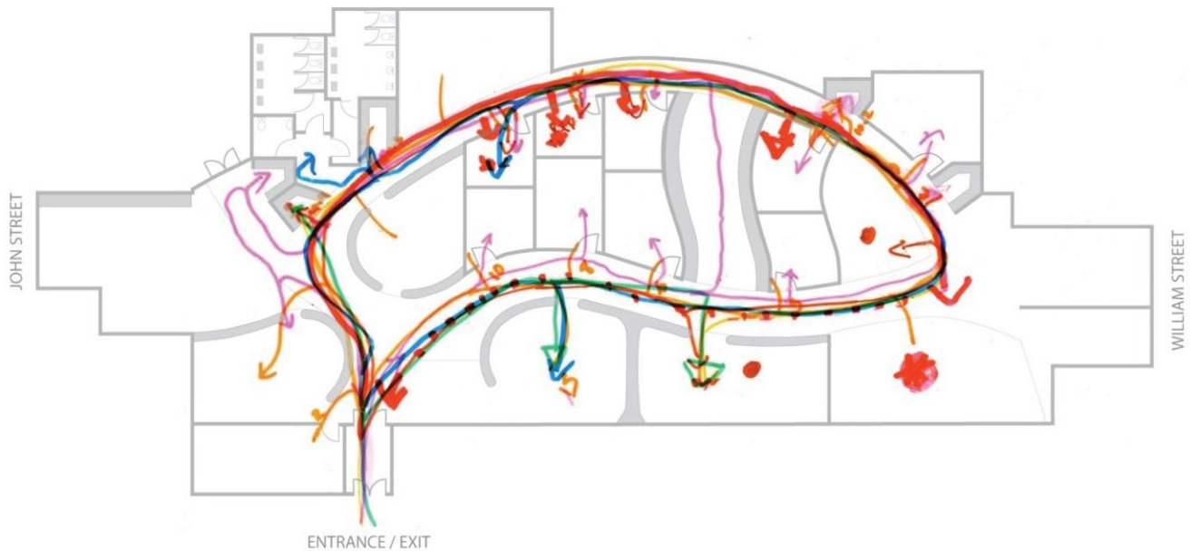
Figure 3. Overlaid visual maps.

becoming clear very quickly. The process also prompted a great deal of discussion about the limitations of the space in peak hours, when preferred spaces were not available, and the degree of social engagement in the space. This flagged a pattern of use that was opportunistic (looking for friends) and indicated that the Hub had become a focus of campus visits, something that was not evident in the diamond ranking groups.