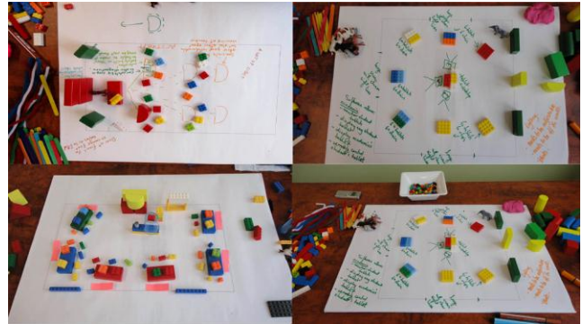
Figure 4. Examples of environments designed by focus group participants.

activity, despite the scheduling challenges involved. The feeling of time constraint may also explain why participants tended to use very basic forms of representation. Most groups used mostly blocks, marker pens, and pipe cleaners, making use of annotation to explain what was being represented (see Figure 4).